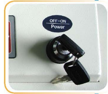
Keyed On/Off switch