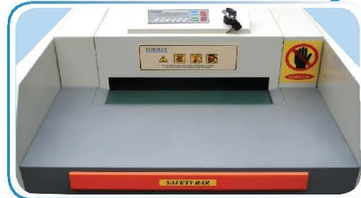
Large infeed deck with conveyor belt feeder and safety bar for immediate shut down