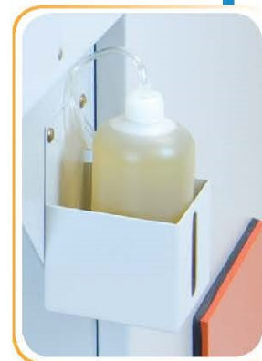
EvenFlow™ Oiling System Reservoir Bottle