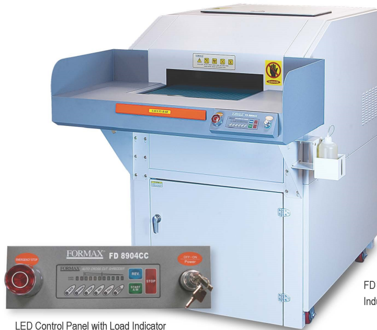
LED Control Panel with Load Indicator