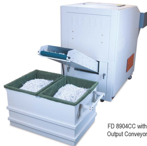
FD 8904CC with Output Conveyor