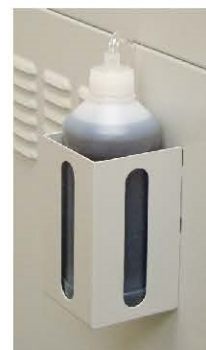
Optional EvenFlow™ Automatic Oiling System